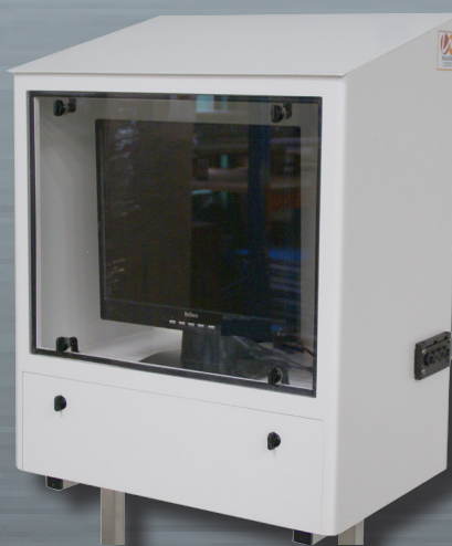
Closing AGRO EC LCD using KDL cable