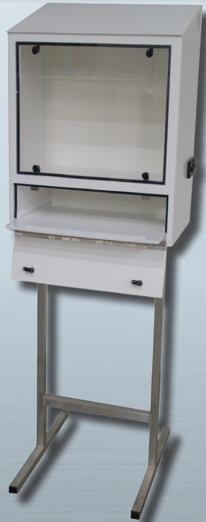
AGRO EC LCD with keyboard shelf, mouse mat with a SIDE ACCESS HATCH

Also available in AGRO EC STANDARD version for cathode-ray screens