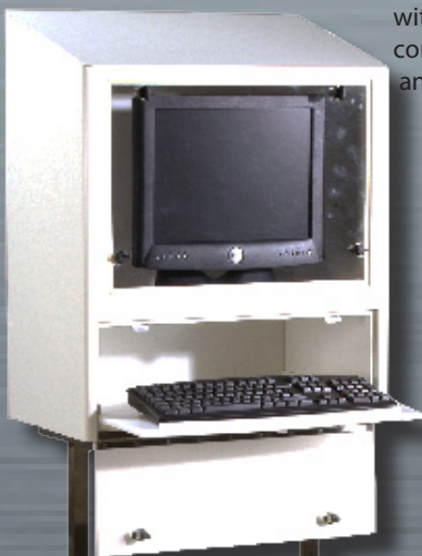
AGRO EC LCD with open keyboard compartment and extended shelf