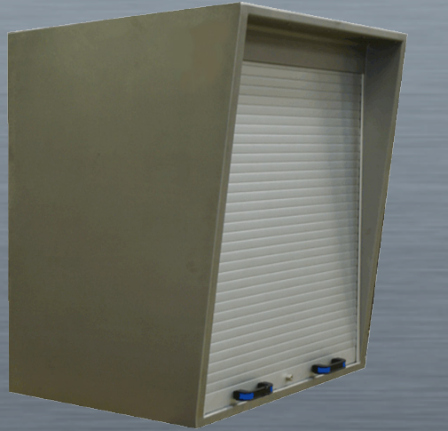
AGRO GM STAINLESS STEEL closed