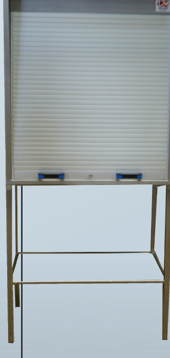
2 handles to make the use easier

Also exists in Larger model: AGRO PM Stainless steel