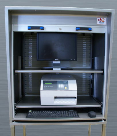
2 extractable shelves