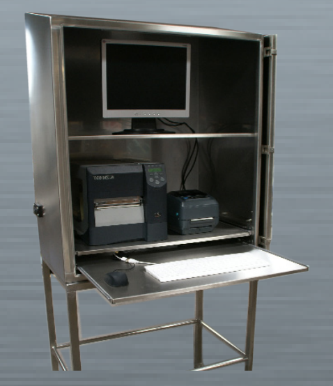
AGRO INOX LC GM opened with the keyboard shelf extracted