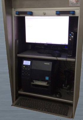
2 extractables shelves