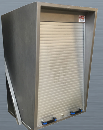
AGRO PM closed rolling shutter + option WALL MOUNTING

W 600 x D 756 x H 1 000(front) 975(rear) mm W 566 X D 470 X H 866 W 545 x D 389 W 545 x H 810 375