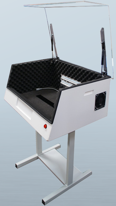
SOUNDPROOFING COVER with SC 1 STAND option

> Please contact us to find out which of our soundproofing covers are suitable for your printer