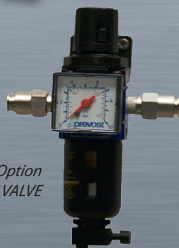
Option PRESSURE-RELIEF VALVE