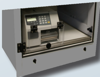
TAV L12 slot