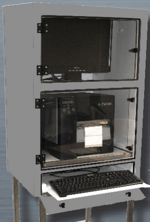
CPI with shelf for keyboard extended