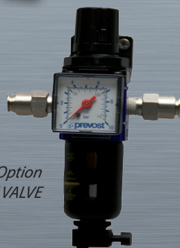
Option PRESSURE-RELIEF VALVE