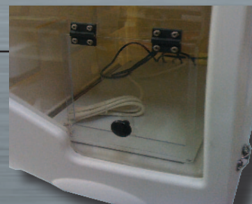
TAV L24 model slot