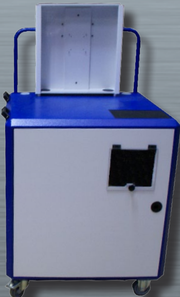
LOGIRACK LCD with printer on extended shelf and PISTOL GRIP MOUNT