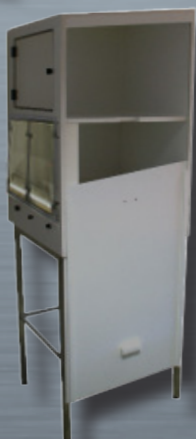
MU 3 DOUBLE with side panel slid open: Access to hardware