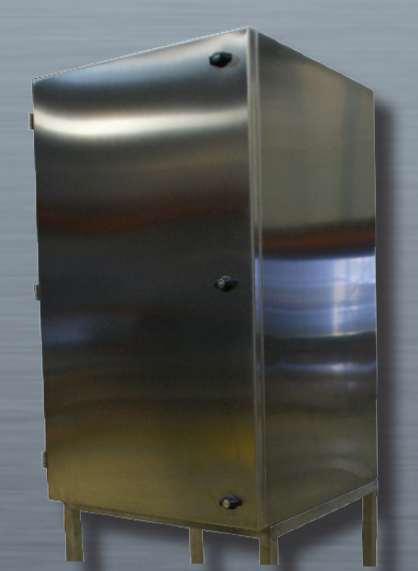
PM INOX opened