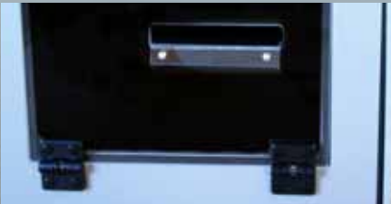
Slot LABEL SLOT + GUIDE