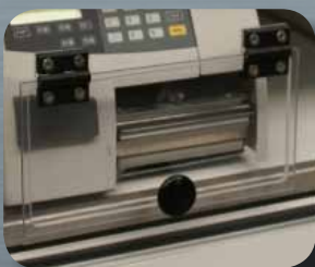
Slot model TAV