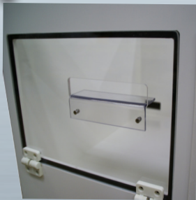
Slot INSPECTION PORT + GUIDE